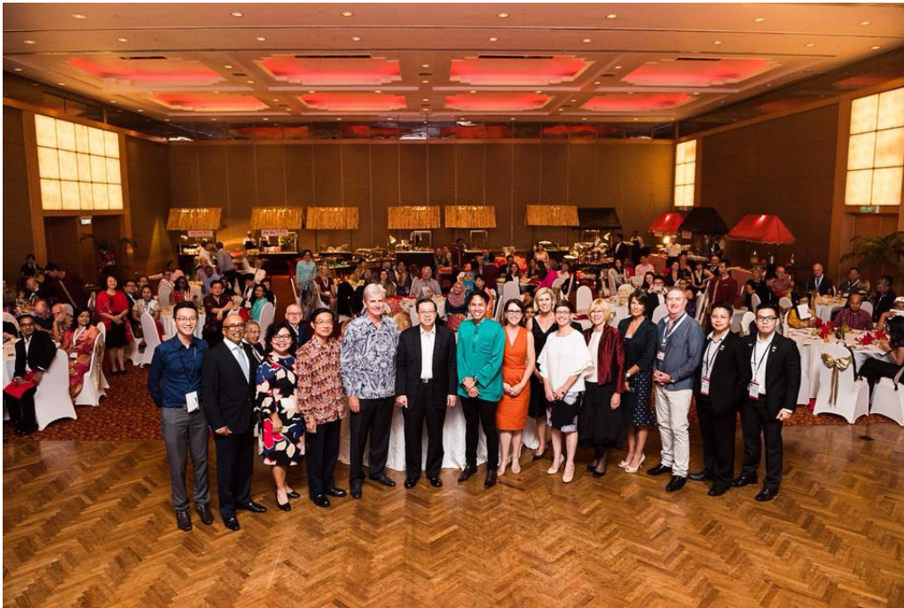
AAED 2018 Gala Dinner hosted by the then Chief Minister of Penang and Finance Minister of Malaysia, the Rt. Hon. Lim Guan Eng (Monash University Alumnus) at the Equatorial Hotel in Penang, Malaysia.