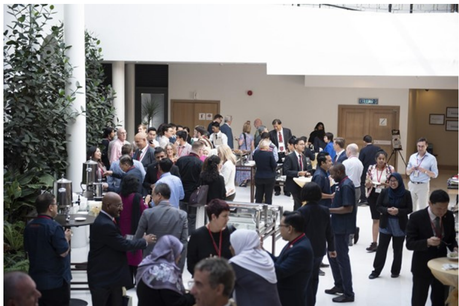
AAED 2019 Morning Tea Break and Networking at the Foyer of Royale Chulan Hotel, Penang, Malaysia